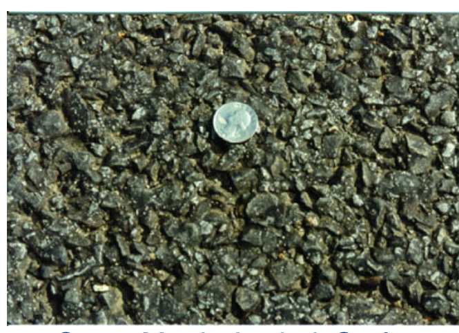
Stone Matrix Asphalt Surface